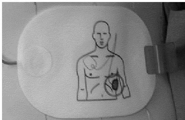
FIGURE 4. Icon for AED1 (one of the four automated external defibrillators studied) depicting the relative locations for both pads.

Resuscitating a victim of cardiac arrest involves much more than operation of an AED. Recognizing the cardiac arrest, calling EMS, and performing CPR as a bystander are all important steps; however, timely