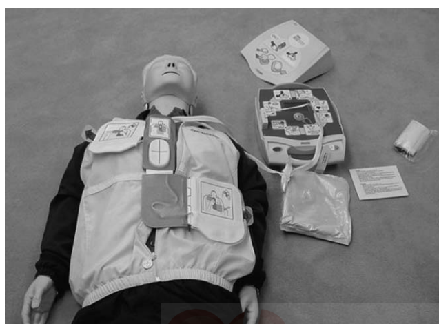
FIGURE 2. An example of electrode pads placed over the victim's clothes.

In contrast, AED1 and AED4 users were successful in delivering a shock in all valid trials. In the time it took users to deliver a shock, AED1 and AED4 were mathematically similar (Figure 5, Table 2). The median times were well under 2 minutes, at 99 and 93 seconds, respectively. The other two devices were significantly slower, with users of AED3 taking 132 seconds (just over 2.0 minutes), and users of AED2 taking 210 seconds (or 3.5 minutes). We also looked at time per AED task for each of the four AEDs, broken down into