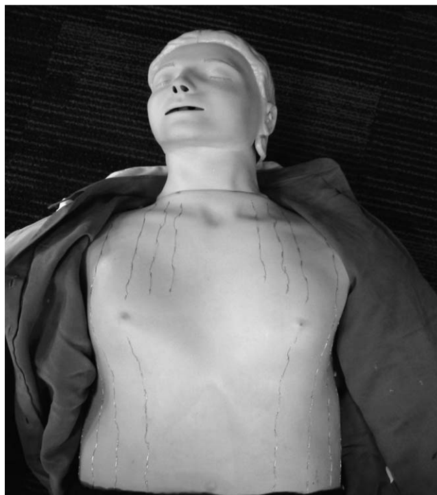
FIGURE 1. The manikin with wires stitched into the skin covering the right and left sides from the upper chest through the abdomen. The wires were attached inside the manikin to a rhythm simulator to provide the electrocardiographic (ECG) ventricular fibrillation (VF) signal. The wires allowed transmission of impedance and ECG signals to the electrode pads simulating a patient in VF.

To examine our assumption that AEDs differ in the quality of voice and graphical prompts, thus affecting usability, four different AEDs were studied: AED1 was the Philips HeartStart OnSite (Seattle, WA), AED2 was the Zoll AED Plus (Chelmsford, MA), AED3 was the Cardiac Science Powerheart (Irvine, CA), and AED4 was the Medtronic CRPlus (Minneapolis, MN). To make the simulation more realistic, clinical AEDs were used as opposed to AED trainers. The AEDs were