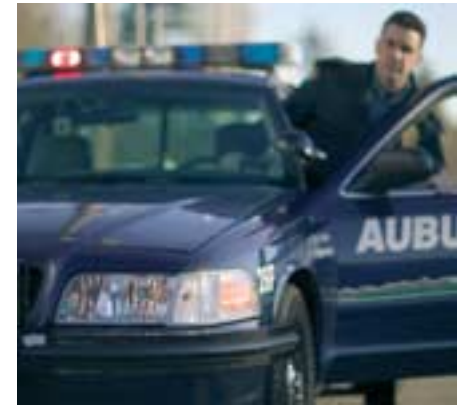
Coming to the rescue Often first on the scene of an emergency, police forces equipped with AEDs can cut defibrillator response time to SCA victims by three minutes.<sup>4</sup>

SCA can happen to anyone, anytime, anywhere and sometimes in extreme conditions. Rely on the Philips HeartStart FRx Defibrillator to be up to the task. In the hands of those who get there first, it provides the power to save a life.