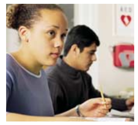
Protecting kids, parents and teachers An estimated 5,000-7,000 children in the U.S. succumb to sudden cardiac arrest annually,<sup>6</sup> many related to sporting events.