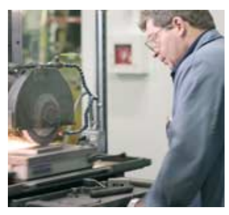
Taking care of business Thirteen percent of workplace fatalities reported in 1999 and 2000 were due to cardiac arrest.<sup>5</sup>